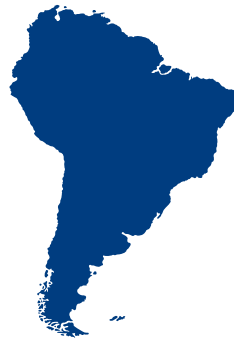
Latin American Spanish